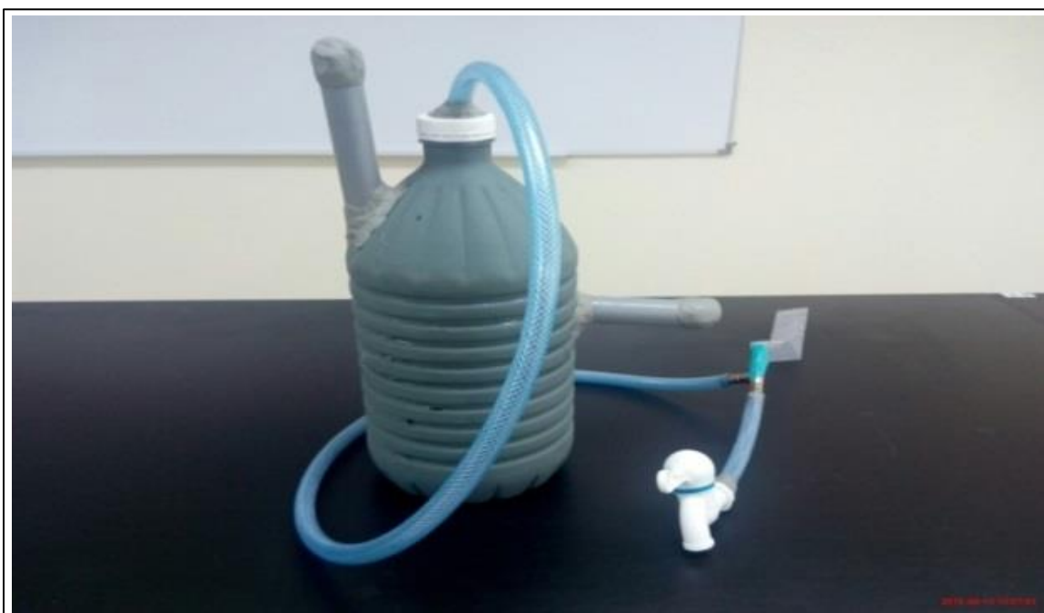
Figure 1 Anaerobic Digester

The set-up of the experiment is shown in Figure 1. The experiments were carried out in four identical modified containers that worked as a reactor or digester in order to produce the biogas. The container was equipped with two straws which was placed at the side of the container and the top of the container respectively. These straws served as inlet and outlet points of the raw materials. This container also equipped with a small flexible polyvinyl Chloride (PVC) tube located at the top of the container cap that is connected to the gas collector to channel the collected biogas to the gas collector unit.